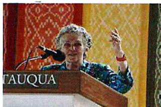
Sister Jean Chittister

She is the senior pastor of the City of Refuge United Church of Christ in Oakland, California and Presiding Bishop of The Fellowship of Affirming Ministries.